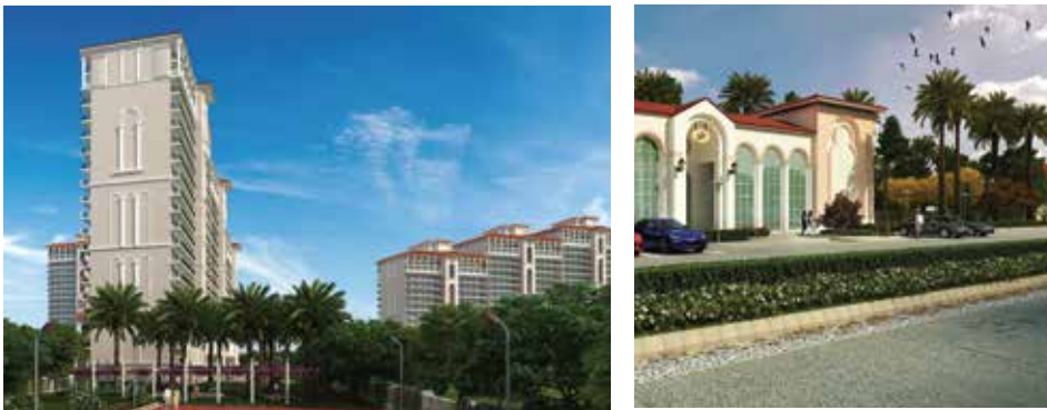
All images for representative purpose only.