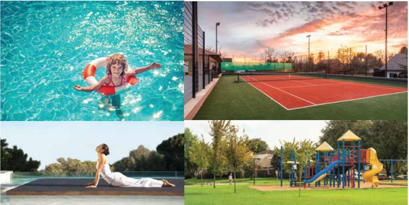
All images for representative purpose only.

With a state-of-the-art amenity bundle that includes two swimming pools, two tennis courts, two gyms, a half-basketball court, a badminton court and a yoga deck. With all this, The Skycourt offers a never-before opportunity to live life to the fullest.